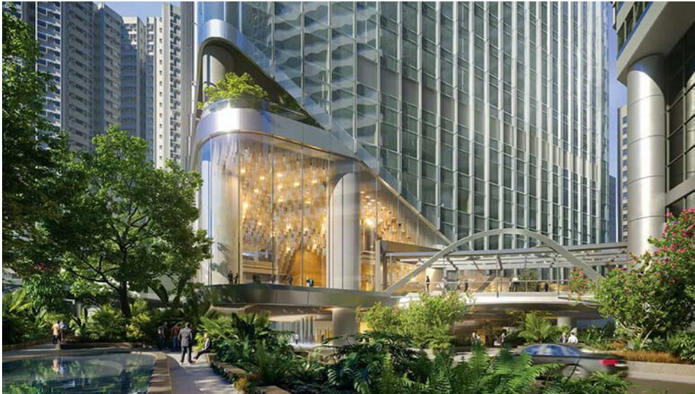
Two Taikoo Place by Swire Properties